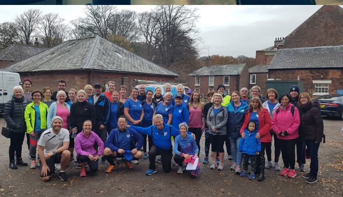
Fylde Council @fyldecouncil · Nov 10 Next week is National Self Care Week!

Visit fitterfyldecoast.nhs.uk to find out more and see the calendar of events happening across Fylde.