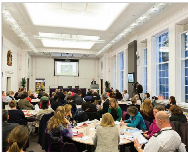
Earl Howe addresses the conference

School healthcare education is based around campaigns, such as protection from the sun, the importance of healthy eating, regular exercise and not smoking. But children are not taught about the health system and how it works. They don't know what a general practice is, or what pharmacists and other healthcare professionals do, he said.