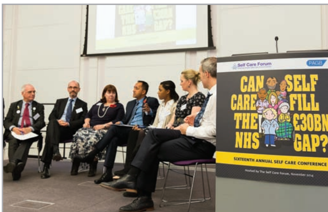
Mid morning panel members

Self care is now a public health issue, but politicians are failing to take it sufficiently seriously, experts have warned. If public health outcomes are to improve, the NHS is to reduce its costs and the Service's future sustainability be assured, all political parties must focus on encouraging people to take more responsibility for their own health when putting together their policies and manifestos ahead of the May 2015 general election, speakers told this year's Self Care Conference, held in London and organised by the Self Care Forum.