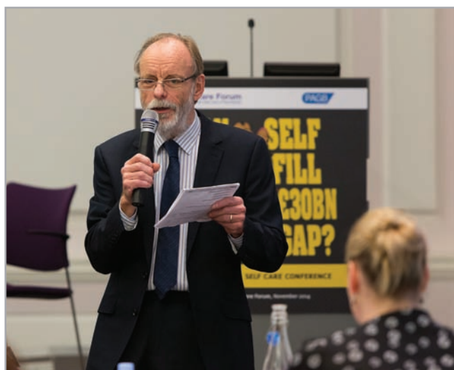
Prof Ian Banks

And he acknowledged that the call by delegates at the Self care Conference for a high-profile public health campaign “is hard to argue with.”